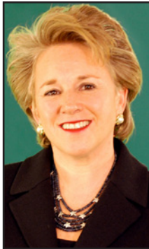
ROBIN S. WEINGAST AND ASSOCIATES, INC.